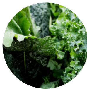
Dark leafy greens